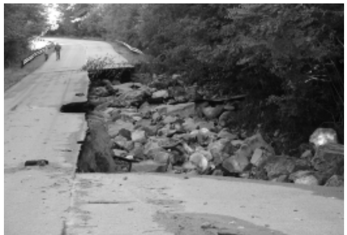
Rt 68, a mile south of the Common on September 19, 2004