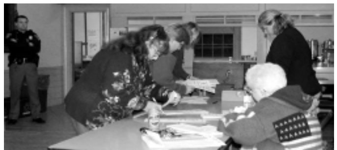
Votes being counted at Precinct #1 after the recent presidential election.

Like the rest of the country, Royalston residents held particularly strong and uncompromising opinions about the candidates in this presidential election. Functioning democracy requires accepting majority rule and moving on. It should also mean staying informed and taking action to affect good policy for the greatest number of citizens. Like the Red Sox and Christmas, democracy requires a little naivete and a lot of hope.