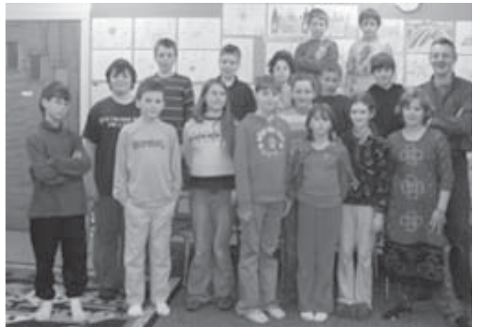
The Village School 4-6 grade is just back from accross the pond