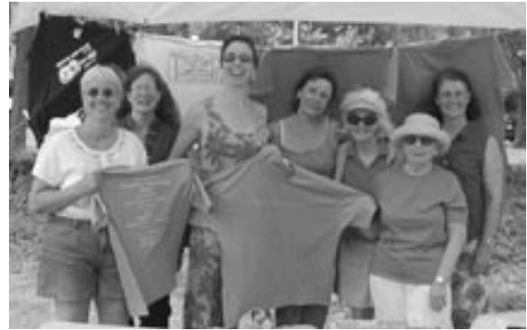
Cultural Council members sell t-shirts at the MusicFest '07