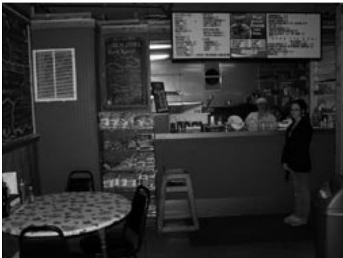
Pick up supper on your way home. The South Royalston General Store offers full course meals for under $7.50 as well as soups and stews to eat in or take out.

Shop locally; eat locally. Your Royalston General Store, conveniently located in the middle of nowhere.