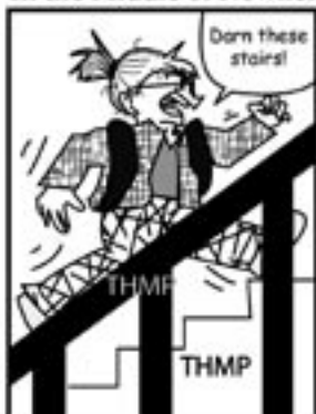
In the Middle of Nowhere: "Running Late"

2012, AM & PM Yoga for Beginners, Capitalism, Hachi, In the Loop, Inside Man, Law Abiding Citizen, Old Dogs, Pontiac Moon, Ponyo, Pre-