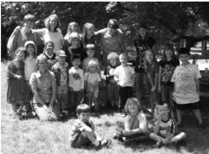
Photo: Summer Art and Nature Camp 2009 at the Village School

The programs are open to the public. For more information, go to www.villageschool.to to download the brochure and registration form. Registration forms are at the library too. Limited openings.