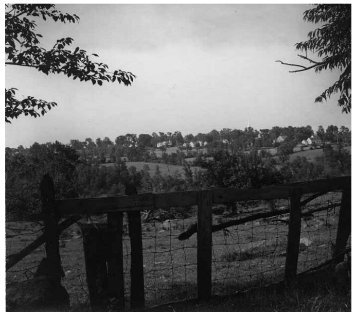
1940 view of Royalston Common from the northeast from the Cole collection.